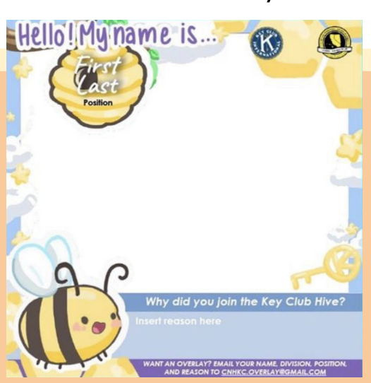
Photo overlays can also advertise our preferred charities or other causes Key Club supports.

allows members to feel personalized by using a photo of their choice while they promote and raise awareness about events such as Regional Training Conference or "What is Key Club?".